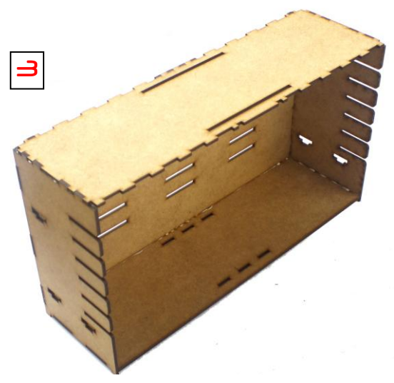
3 glue on the top plate. Ensure right angles

1 the pieces that need to be glued together.