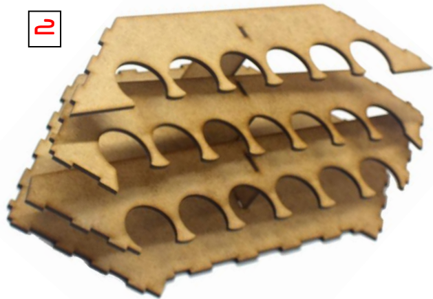
2 first glue in the 3 paint holders into the tabs of middle strut (they only fit in the right slits). Glue the middle strut into the base plate.