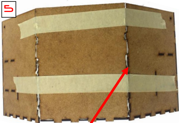
5 Glue on the other side / back wall and then the large back wall with plenty of glue between the angled pieces to ensure they hold properly and the gaps are closed.