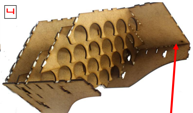
4 then glue in one back / sidewall, round hole facing up.